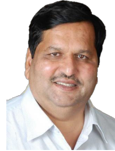
Mangal Prabhat Lodha (Director, AIC-RMP Foundation) MLA, Maharashtra & Chairman, Lodha Group